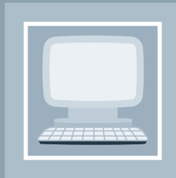
Integrated Substation Condition Monitoring