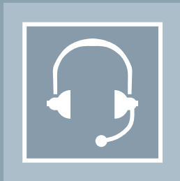
Expert support via Service Level Agreements