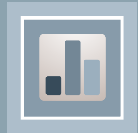
i-Con Stand-alone solution for GIS and AIS